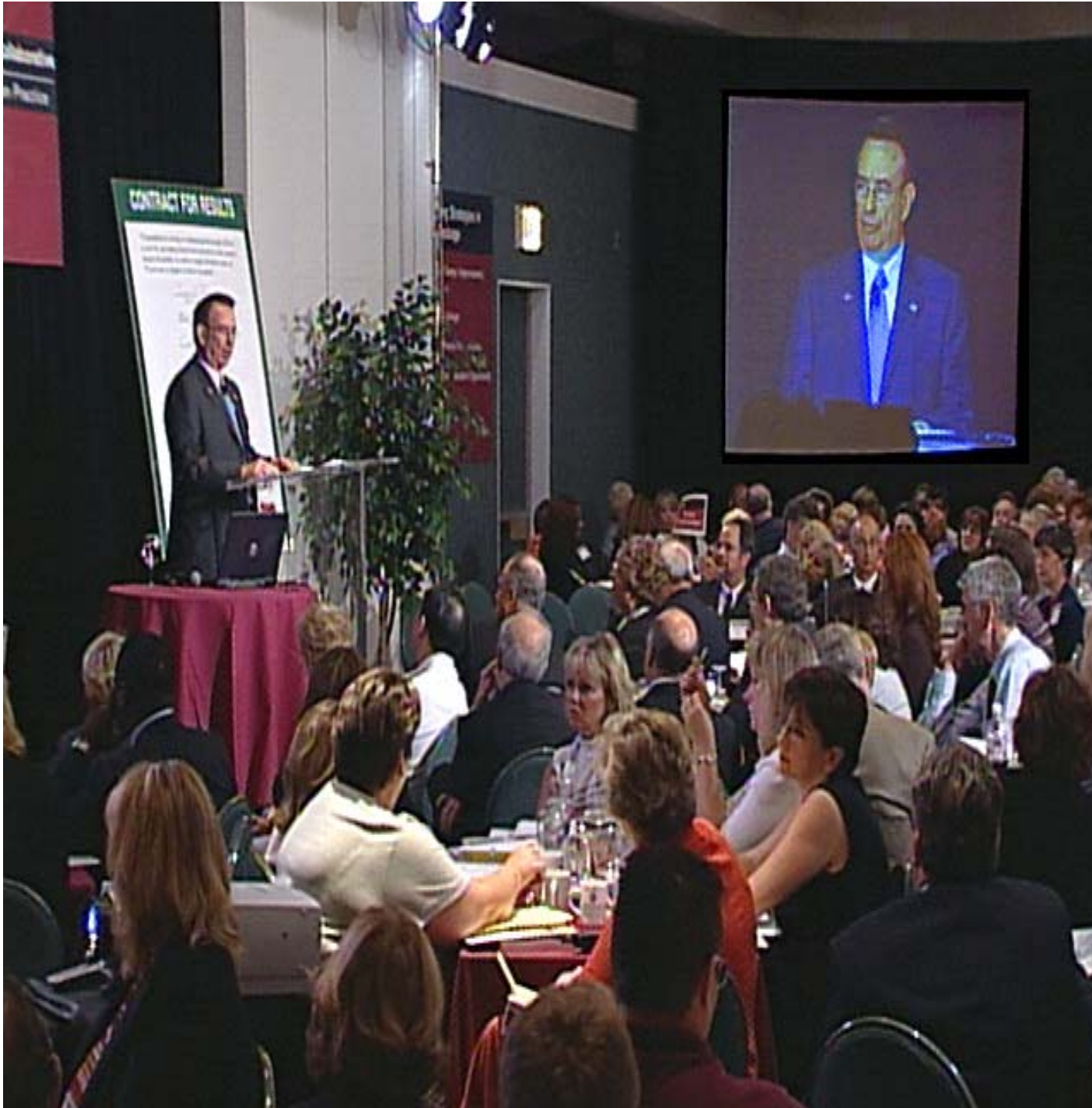
Former HHS Secretary Thompson Launching the Collaborative